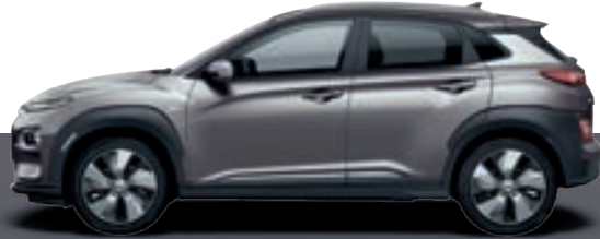
Galactic Grey - Pearl (No Cost Option)