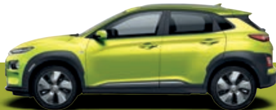
Acid Yellow – Metallic/Pearl