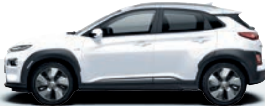
Chalk White - Metallic