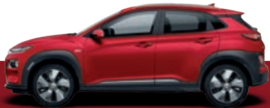
Pulse Red – Metallic/Pearl