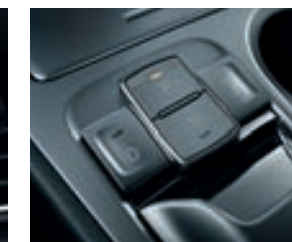
Electronic Gear Shift Button

The Kona Electric's spacious interiors are as comfortable as they are modern. The dashboard boasts an intuitive 7" digital cluster display making critical information readable at a glance, whilst the centre-mounted 10.25" touchscreen gives quick access to car functions including navigation. You can also shift gear into Drive, Neutral and Reverse with a single button press on the central column. What's more, regenerative braking controls on the steering column let you balance acceleration and efficiency by shifting power to the wheels or battery as needed.