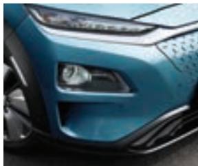
Closed Grille and Twin Headlight Design

Every destination needs a journey. Why settle for less when the Kona Electric is packed with innovative technology and striking design features, to get you there in comfort and style.