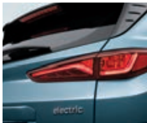
LED Rear Lamps