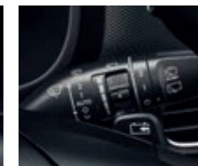
Paddle Shifter (Regenerative Braking Control)