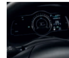
7" Digital Cluster

The simple, sleek interior puts you in control. A perfect blend of advanced technology and elegant design keeps you informed without being distracting, letting you drive with confidence.