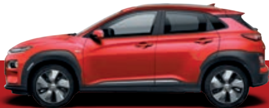
Tangerine Comet – Pearl