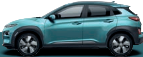
Ceramic Blue - Pearl