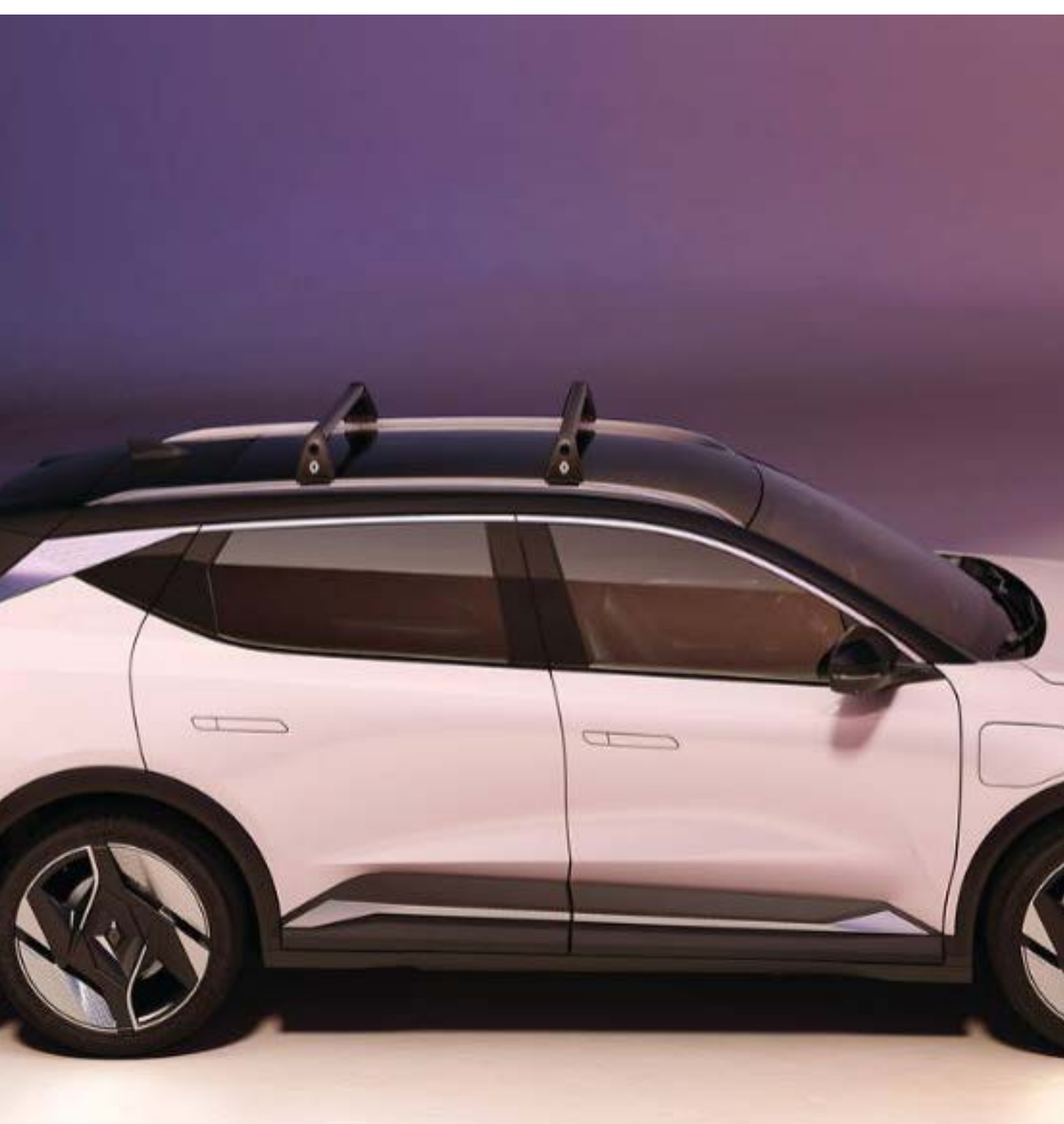
quick fix longitudinal roof bars 738207220R