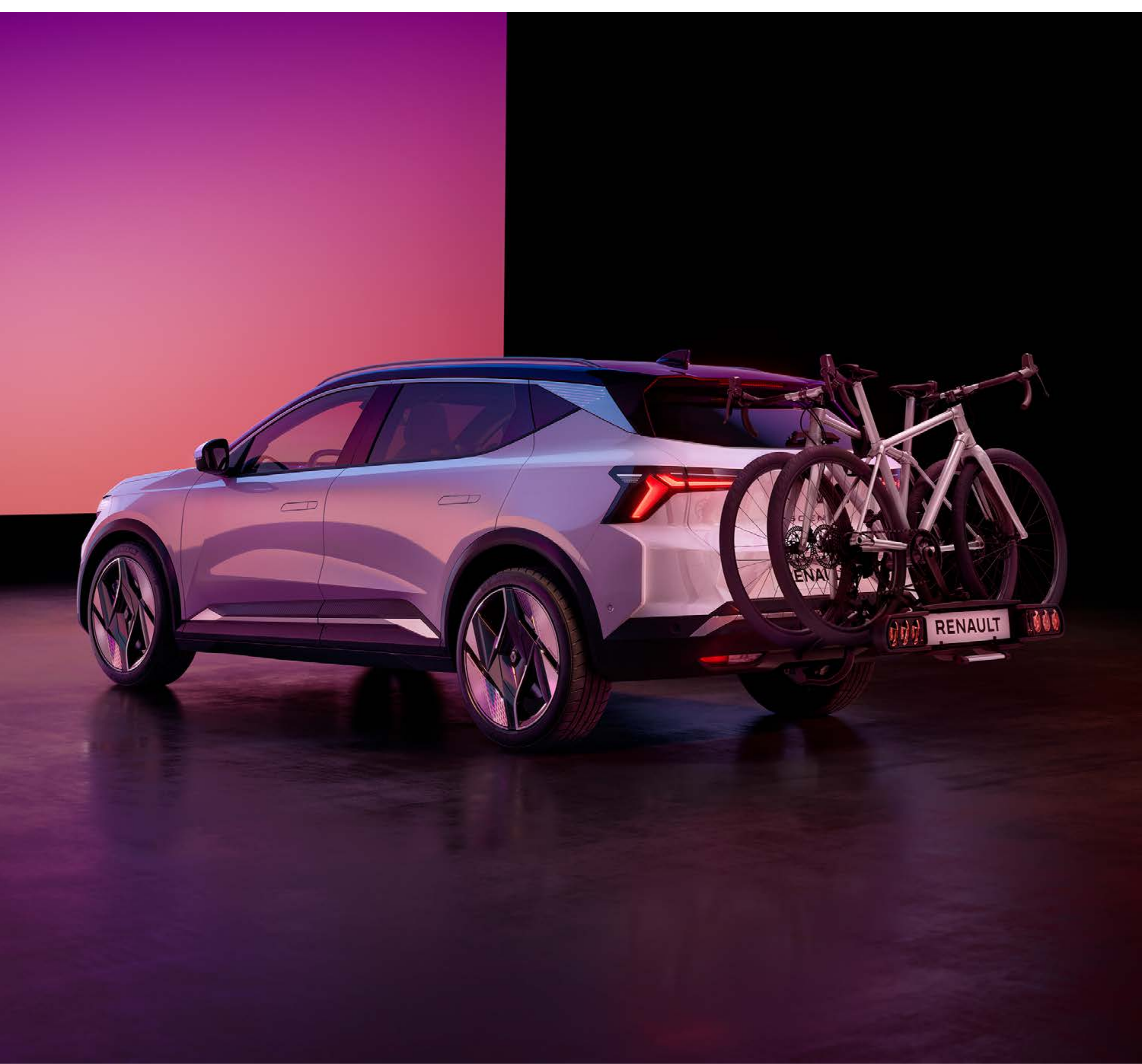
tool-free removable towbar pack and 2-bike rack on towbar

Equipped with a towbar, Renault Scenic E-Tech 100% electric can tow up to 1.1 t and easily transport a bike rack (75 kg of vertical load).