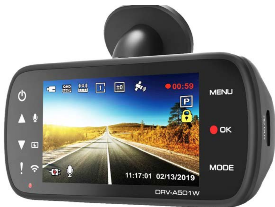
KENWOOD front dash cam 7711599197