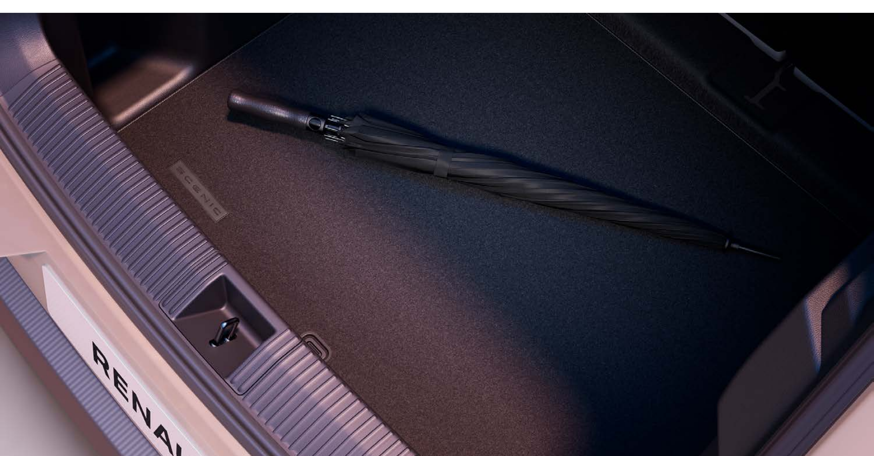
boot liner 849P74058R

The Renault mudguards protect the underbody and wheels from water, mud splatter and flying gravel.