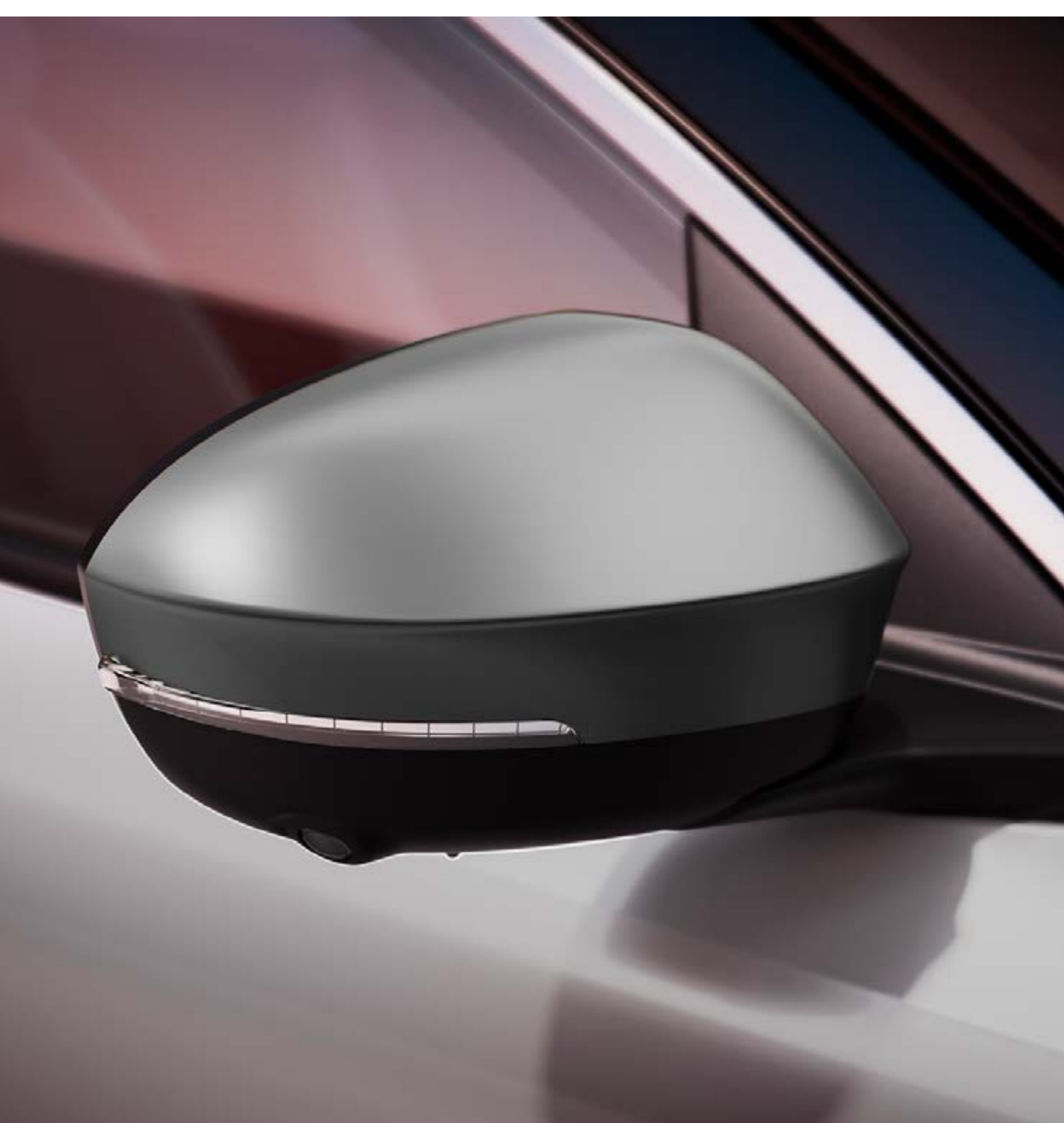
satin metal grey