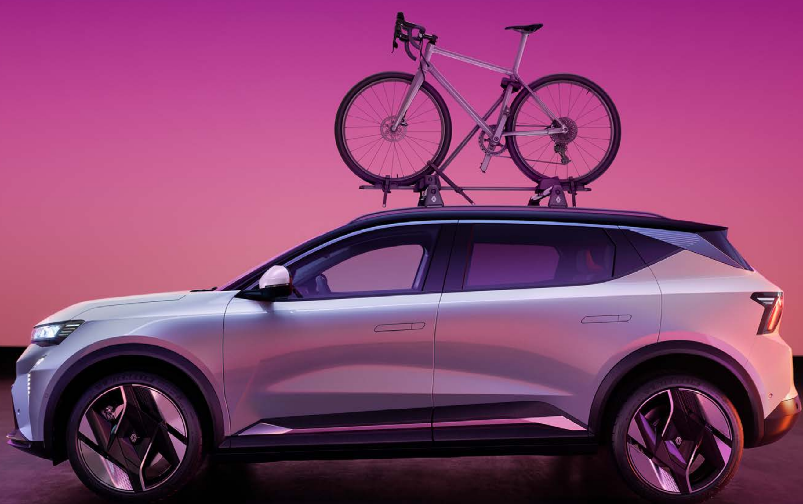
roof-mounted bike rack bars

Choose from our range of touring accessories, bicycle racks and towbars.