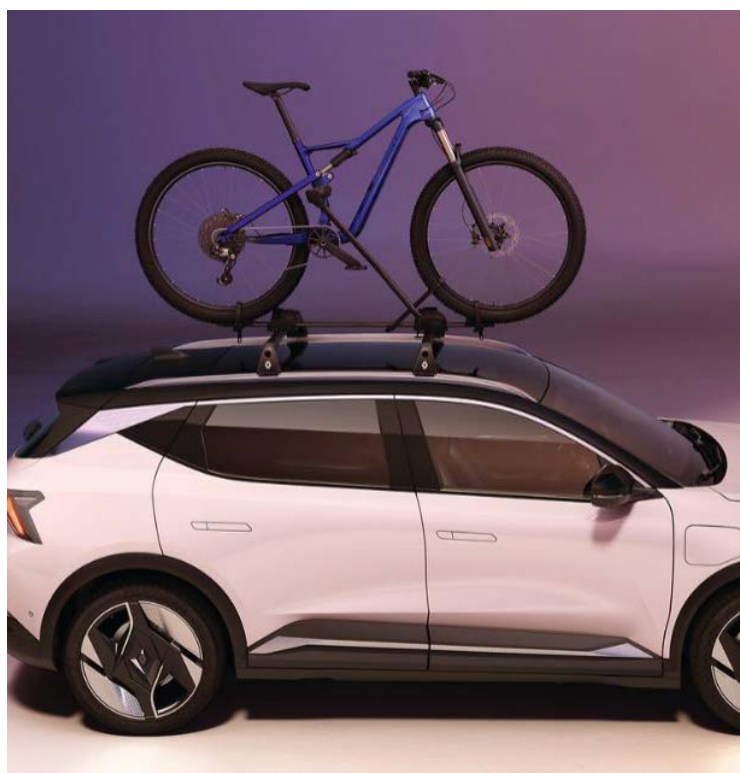
roof mounted bicycle carrier 7711949992 x 2