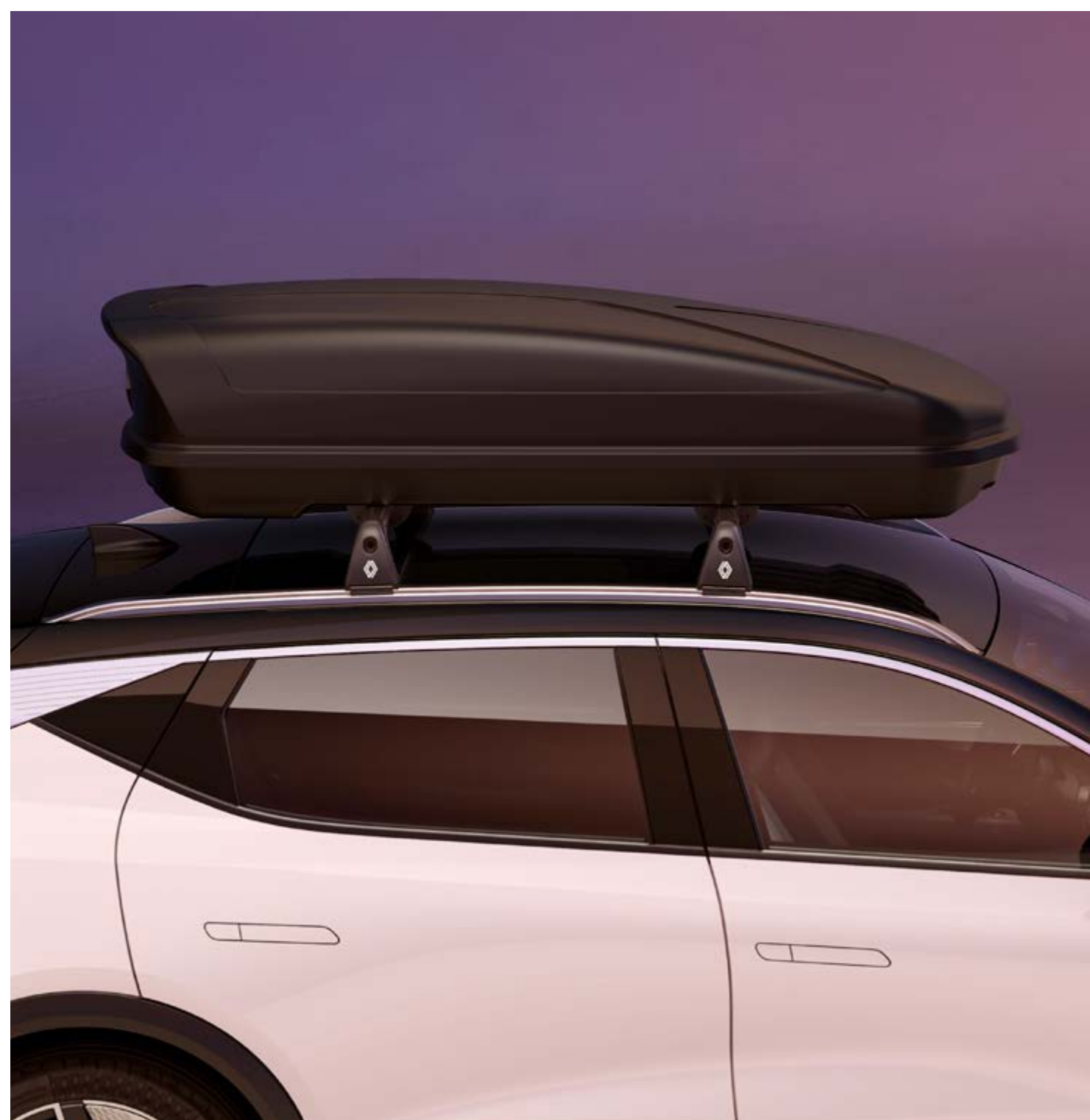
roof box 480L 7711948972