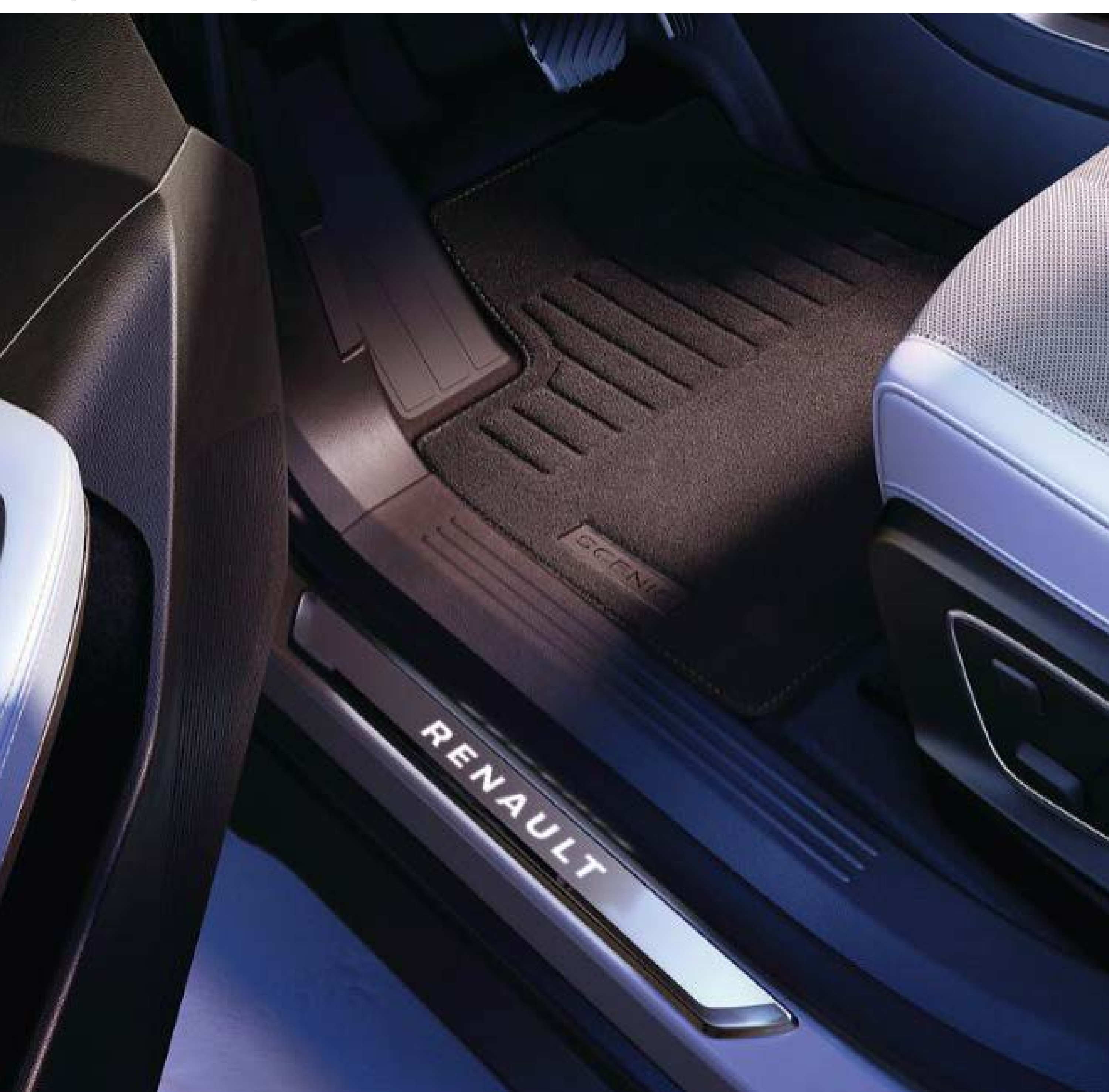
illuminated door sills 8201731140