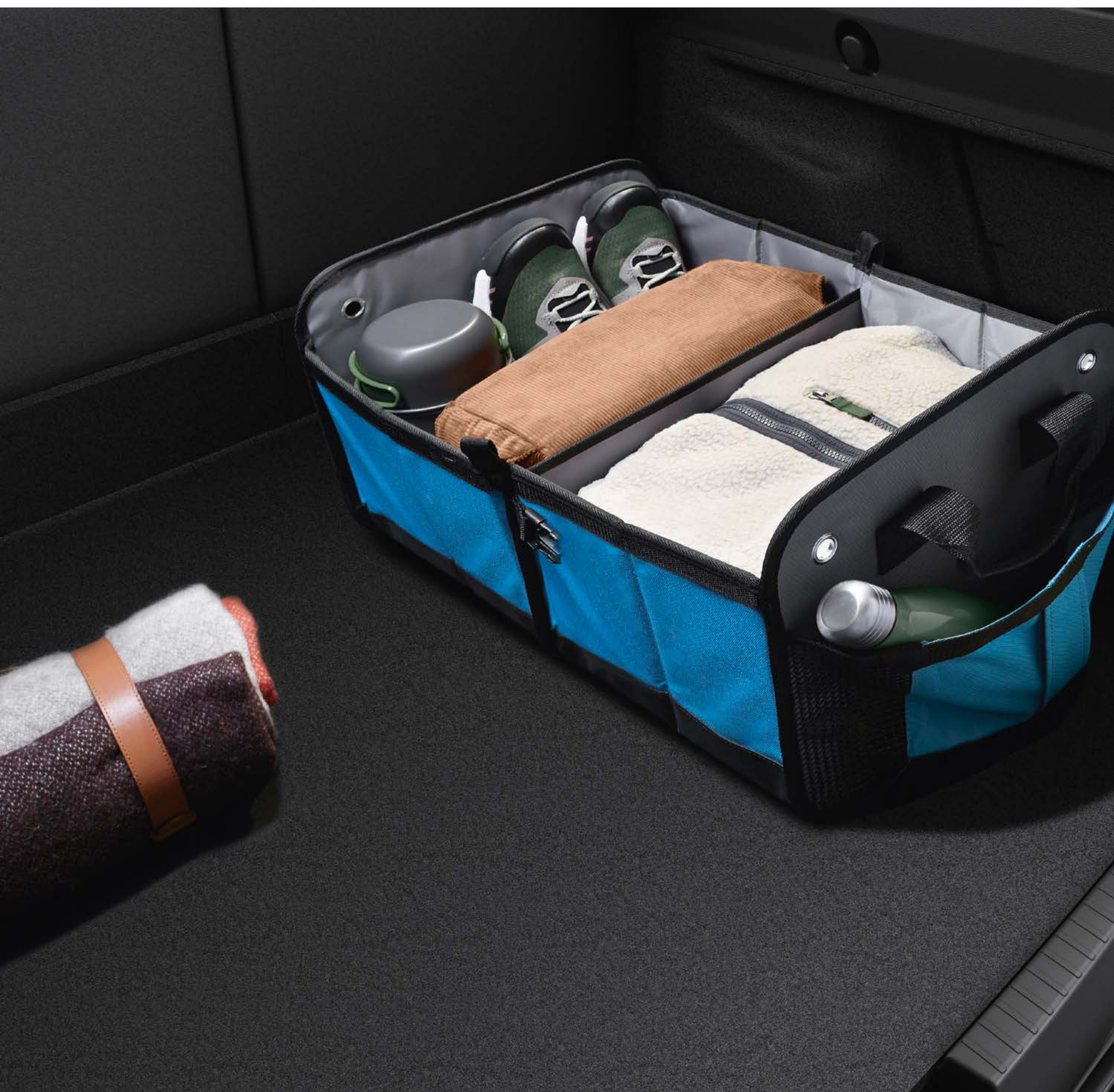
Compartmentalised boot storage box 7711940885