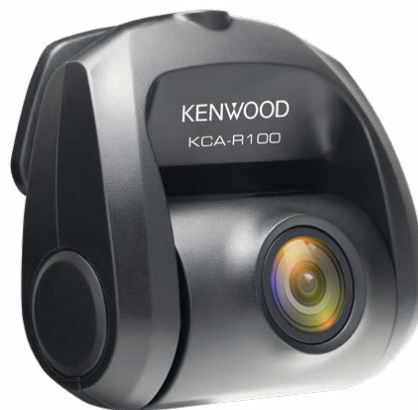
KENWOOD rear cam 7711599212