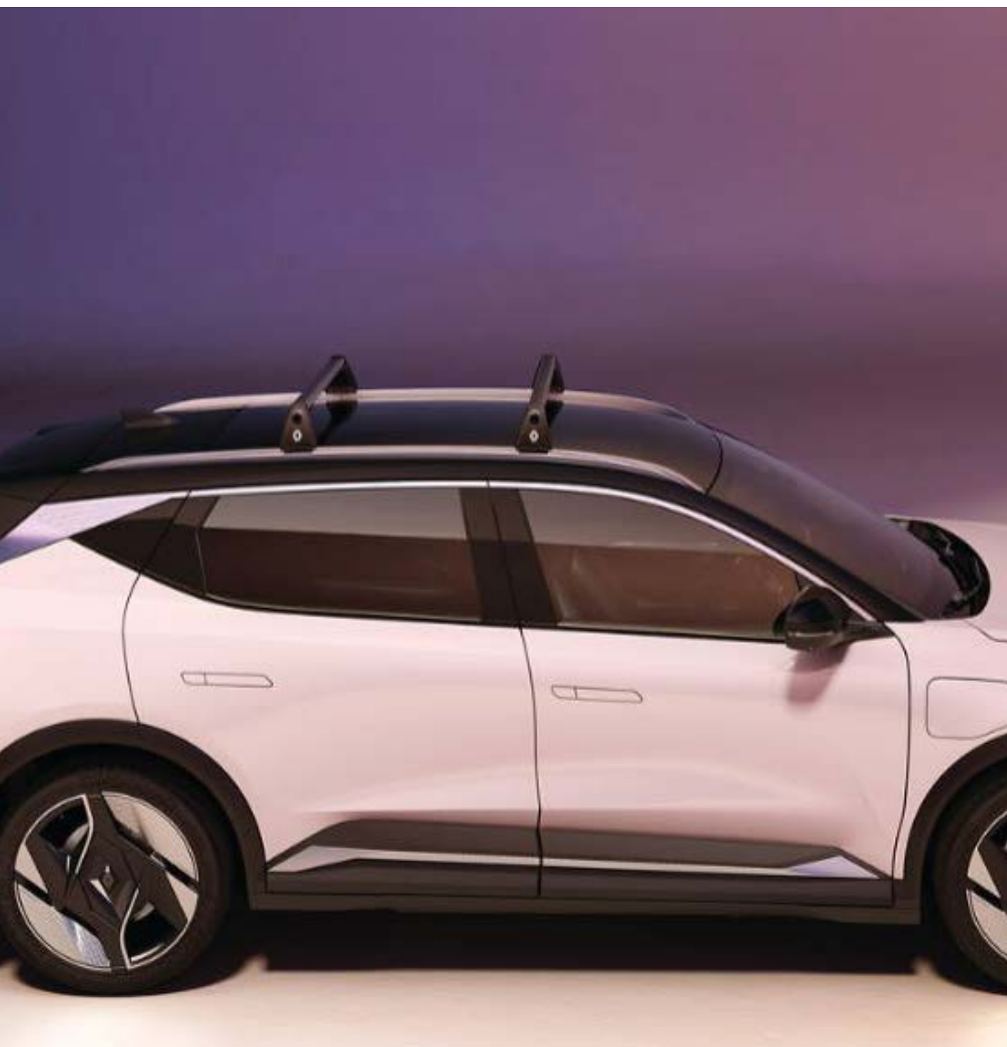
quick fix longitudinal roof bars 738207220R