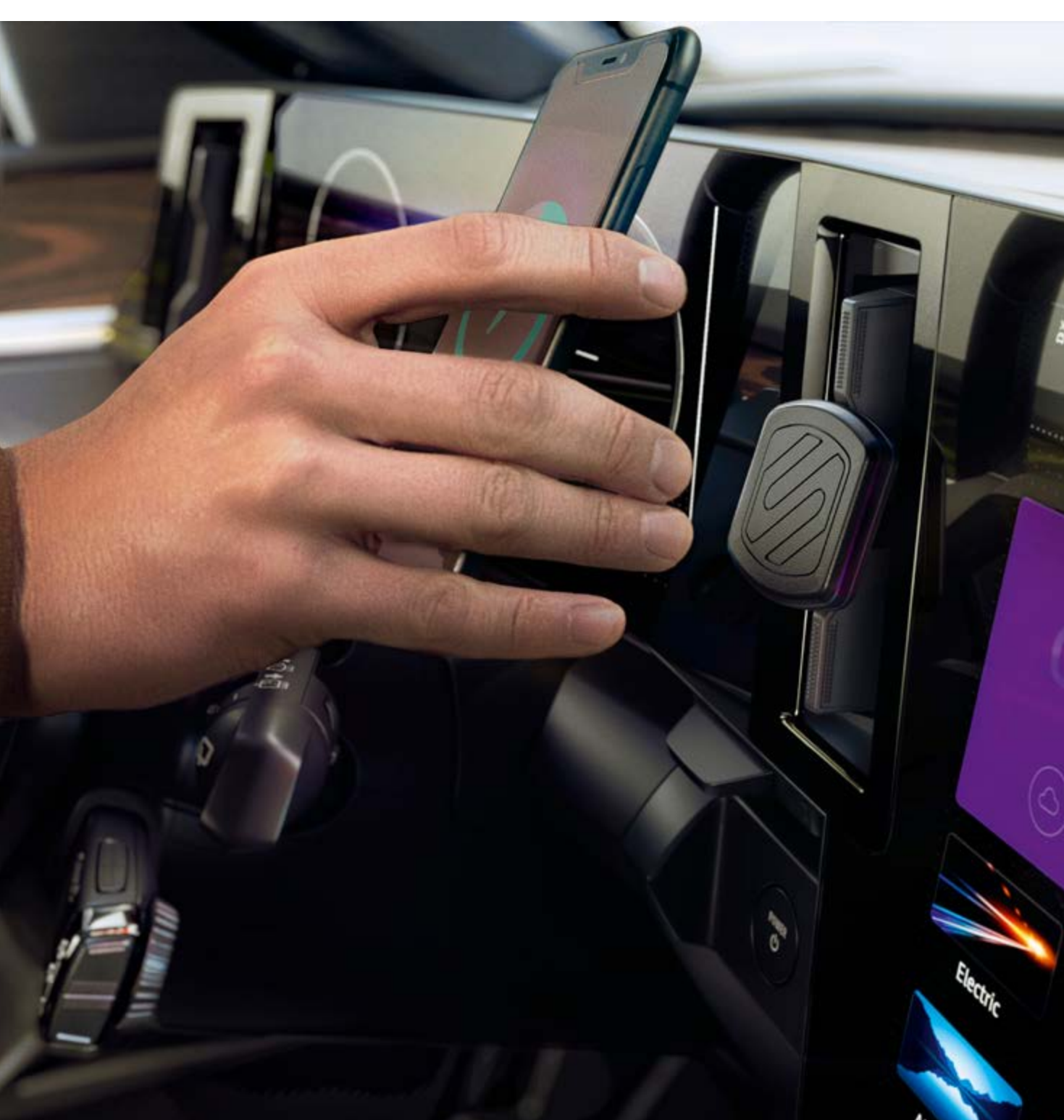
magnetic vent-mounted smartphone holder 7711784774