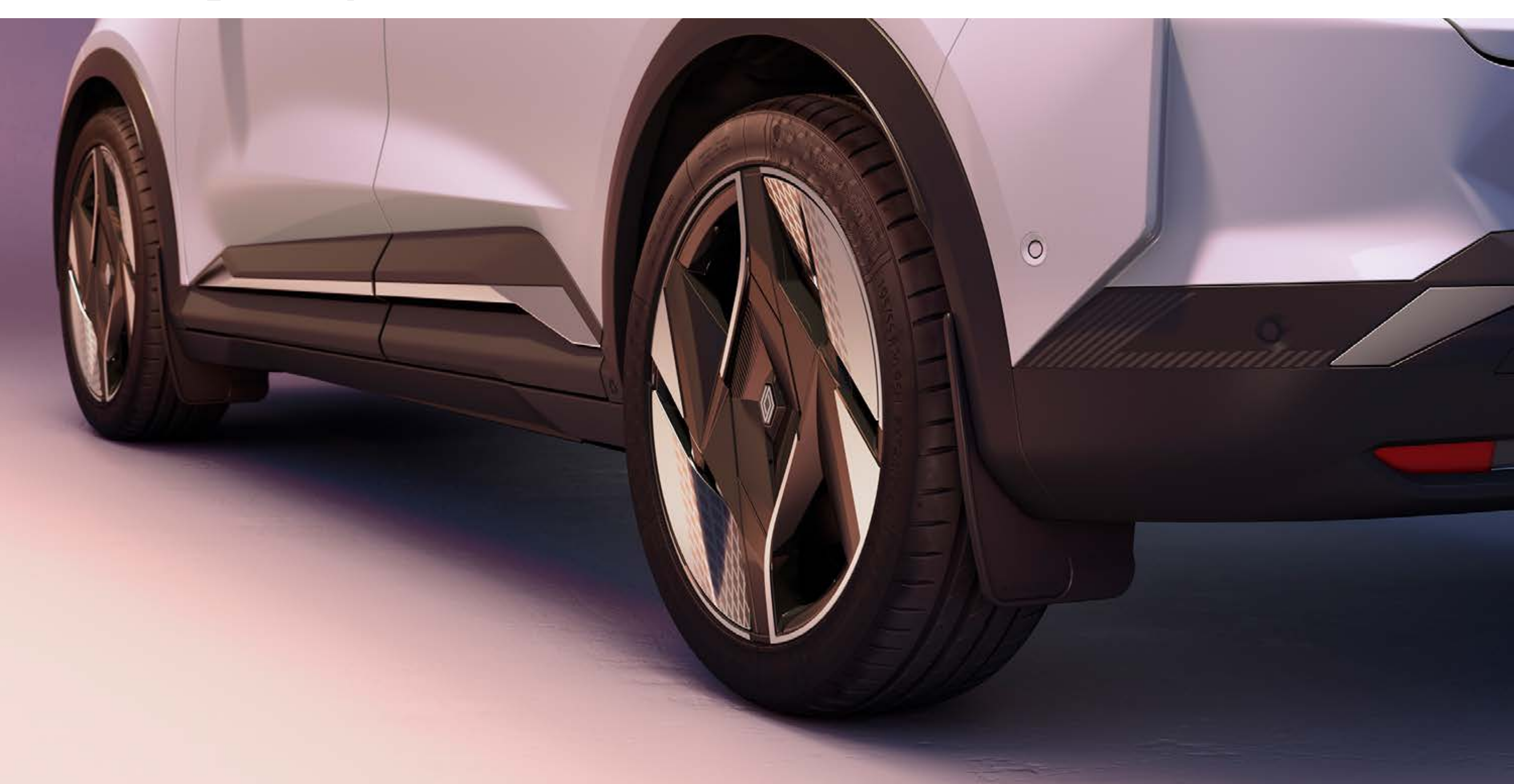
front and rear mud guards 7717274244