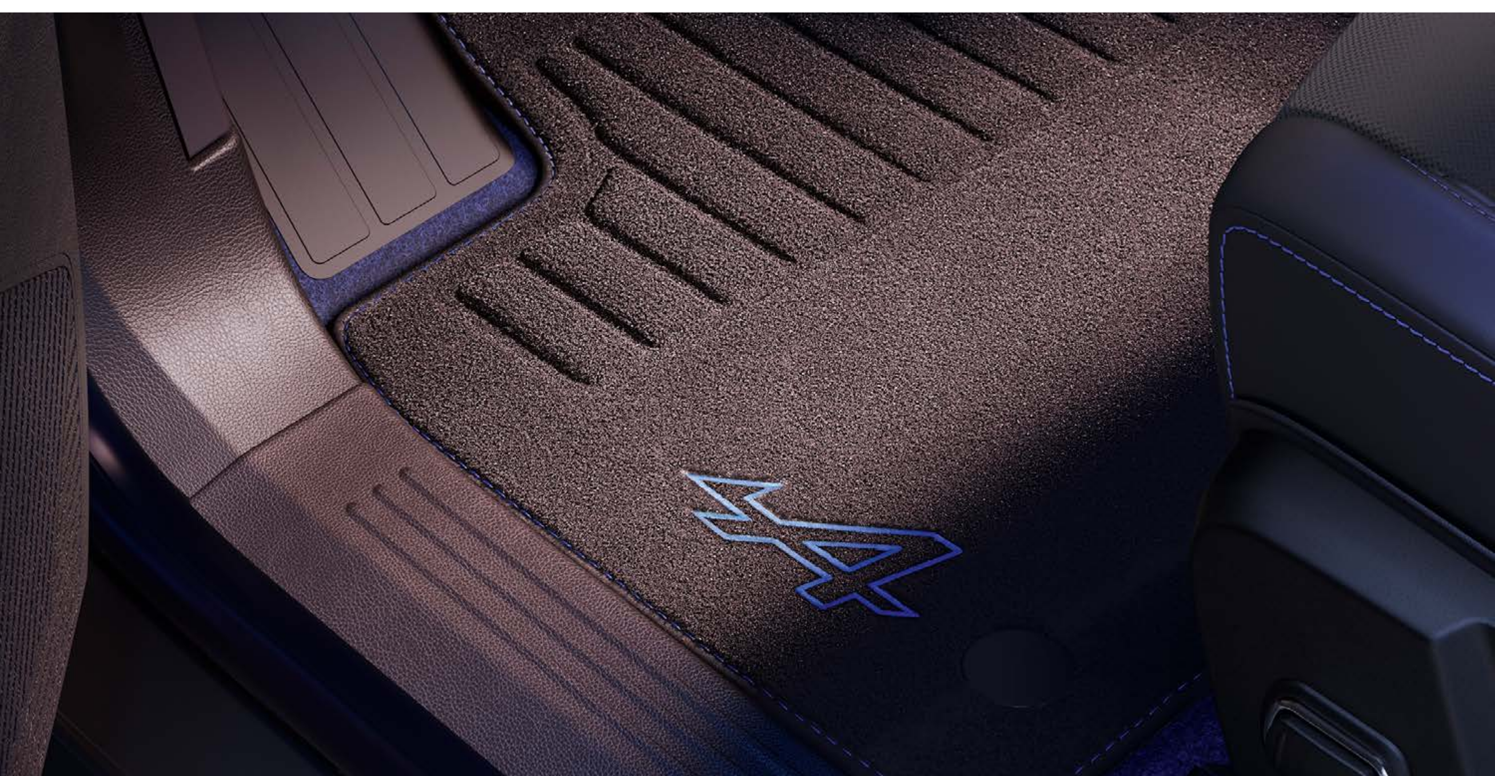
esprit Alpine mats