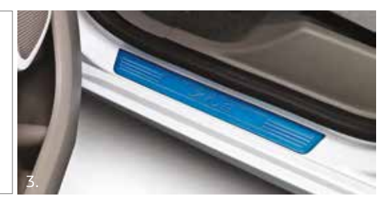
Protect your ZOE from the perils of the road and the car park with the protection pack.

1. Boot liner: The custom-made boot liner allows you to place various items in the boot (especially dirty items) and is a good way of protecting the original carpet. 2. Alarm: The essential accessory to ensure the car's security. It will protect effectively from theft of the car and objects inside it. 3. Door sill trim: Add an extra touch of class to your Renault ZOE.