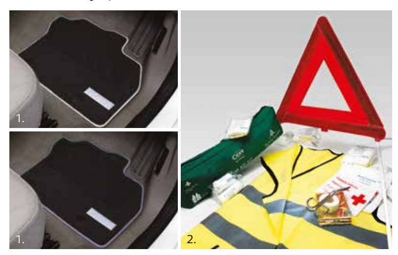
1. Premium mats: Available in two different colours to harmonise with your car colour choice, these made to measure carpet mats will protect your car's carpet. 2. Safety kit: Complete kit including a warning triangle, a thermal blanket, a vest and a first aid kit.