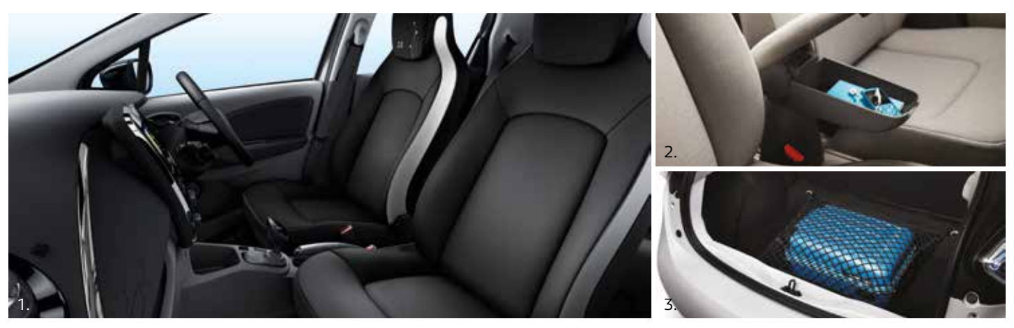
Enhance the comfort, practicality and style of your ZOE with the Luxe pack.