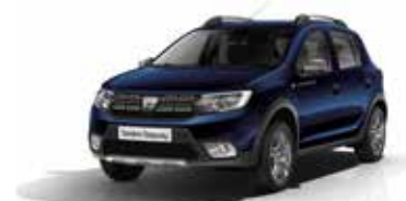
Cosmos Blue (RPR)