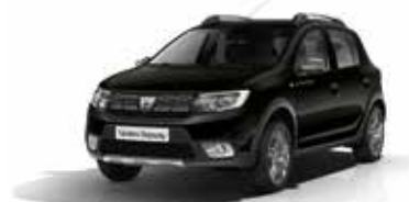
Pearl Black (676)