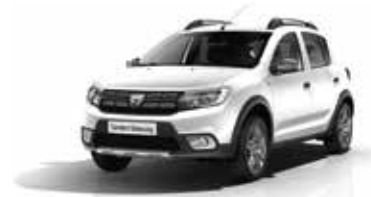
Glacier White (369)