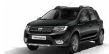
Slate Grey (KNA)