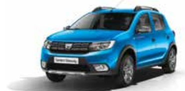
Azurite Blue (RPL)