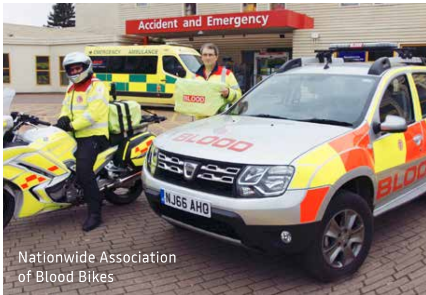
Nationwide Association of Blood Bikes