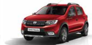
Cinder Red (B76)