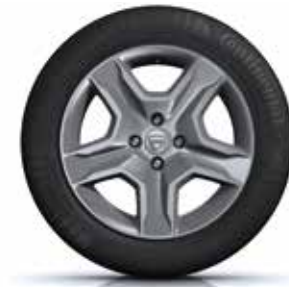
16" "Stepway" design wheels