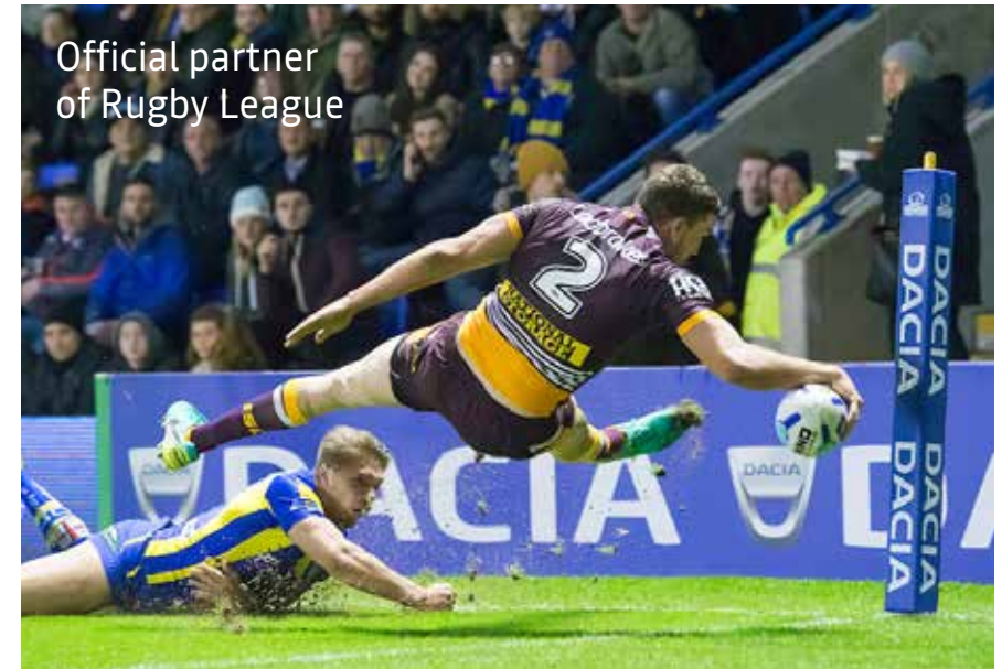
Official partner of Rugby League

For us, putting in the extra mile doesn't stop at making great value cars. We take great pride in playing an active part in the community and giving back to communities throughout the UK. We support the life-saving work of the Nationwide Association of Blood Bikes . We get stuck in as the official partner of Rugby League . We also run an annual Dacia Day , full of fun and games for our amazing Dacia drivers – maybe we'll see you there next year? In the meantime, keep up with us on our Facebook page or Youtube Channel.