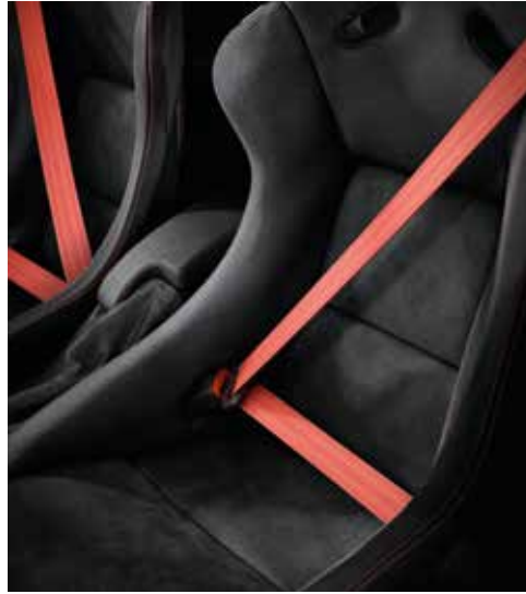
Recaro 'Pole Position' bucket seats in Alcantara