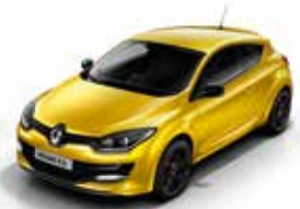
LIQUID YELLOW ENV