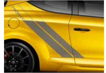
Silver Trophy stripping