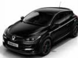
DIAMOND BLACK GNE