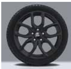
18" 'Tibor' matt black alloy wheels