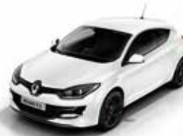
ARCTIC WHITE QNC