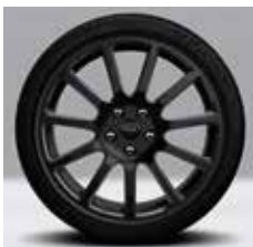
19" 'Turini' Speedline in black