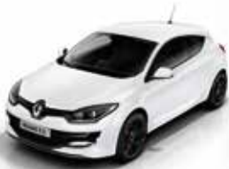
GLACIER WHITE 369