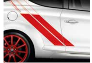
Red Trophy-R stripping