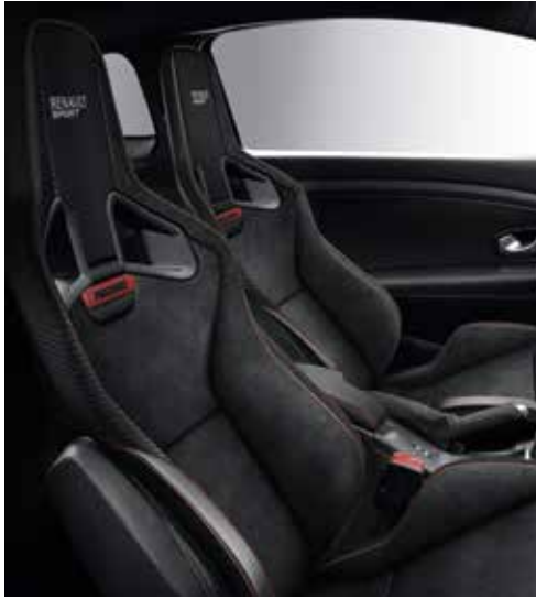
Recaro bucket seats in leather and Alcantara