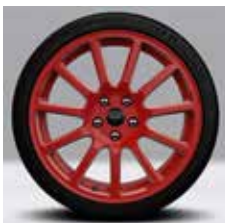
19" 'Turini' Speedline in red