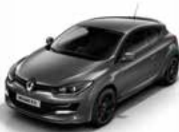
OYSTER GREY KNG